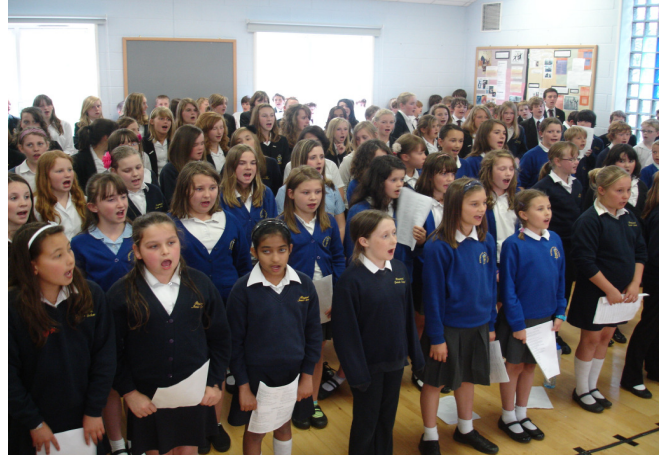
year 6s at Ringwood Singing Day 2011

competed very successfully in local Music Festivals for many years and performed regularly.