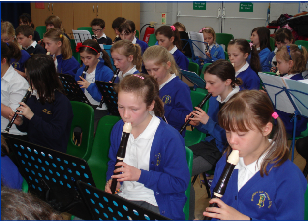
Recorder Group at Recorder Jamboree 2011

Children in Planet Team who wish to learn the descant (Yrs 3/4) or treble (Yrs 5/6) recorder, are offered a weekly group lesson during their lunchtime.