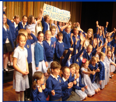
Winning the cup at the Bournemouth Festival 2011

We have a fantastic school choir which is open to Planet Team children (Years 3 - 6) which meets on Wednesdays after school, from 3.20 - 4.10pm. This choir gives children the additional experience of singing in a much more structured and formal way, learning to sing in unison and parts, with the emphasis on sing-