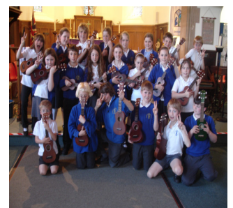
Ukulele Band performing in church 2011